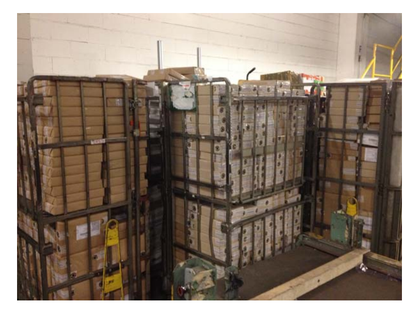
44. The USPS itself has published photographs of packages of cigarettes collected within its postal facilities in connection with its "Return to Sender" program described below:

43. Once found to contain cigarettes during the package sampling conducted by U.S. Customs and Border Control ("CBP"), the uniform appearance of packages shipped by bulk cigarette sellers allows easy identification by the USPS's personnel of subsequent shipments. For example, in connection with ATF's "Stop Sticks" investigation described below, the cigarette packages were all of a size and shape consistent with cartons of cigarettes, were uniform in appearance, and had the same return addresses, as illustrated in an April 2013 photograph: