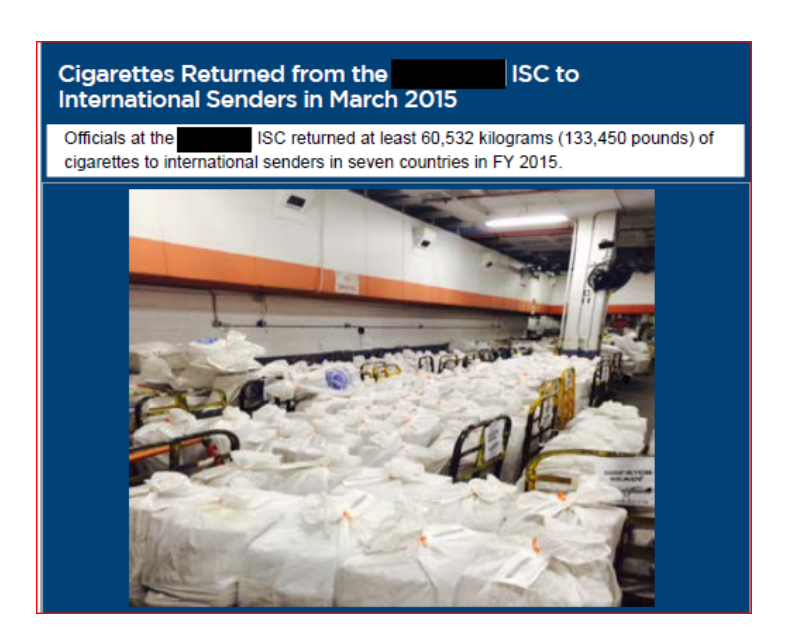
Prohibited Inbound International Mailings, Rpt. No. Ms-Ar-17-008 At 9 (July 18, 2017) ("Prohibited Mailings Rpt").